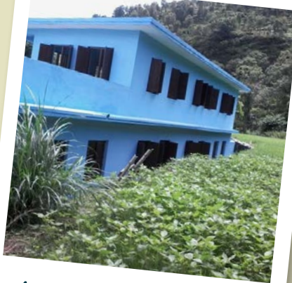
A Strong Foundation

None of our schools were impacted heavily by the earthquake and some served as shelter to the community in their time of need. In addition, since the earthquake we have made measurable progress.