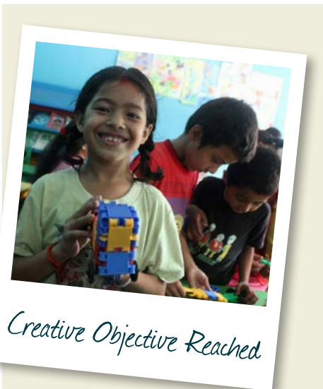
Creative Objective Reached

We have now fully fitted creative grade 2 classrooms in all 11 schools. Our objective for the coming year is to do the same for grade 3.